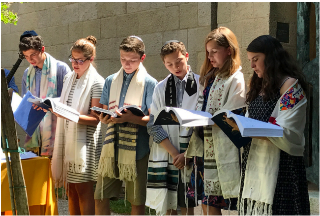
4 students became bar or bat mitzvah in Israel in 2017 and 4 are preparing to go this coming summer.

85 students became bar or bat mitzvah this year.