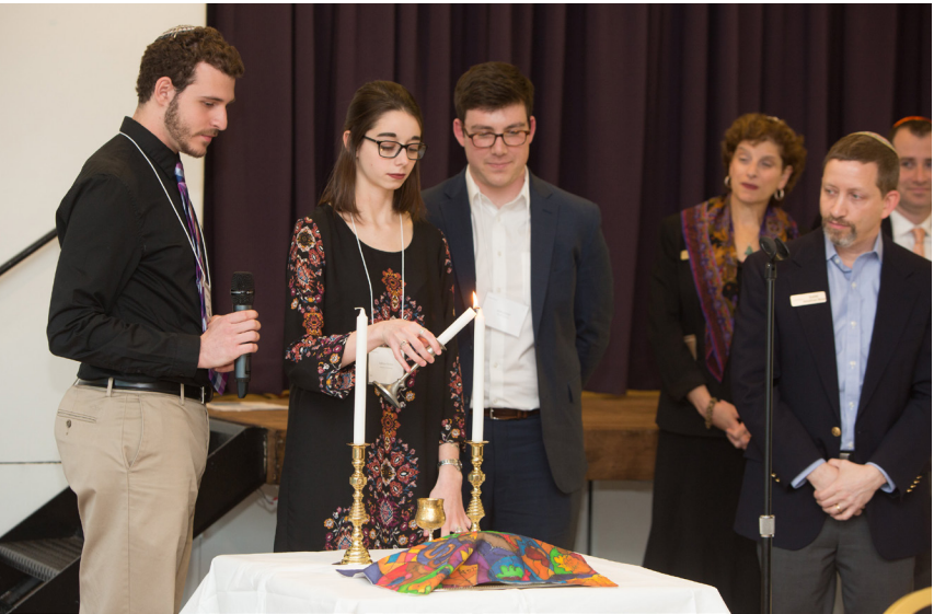
College students from around the country gathered for Shabbat services with Temple Sinai before the March for Our Lives in March 2018. 200+ members attended the march.