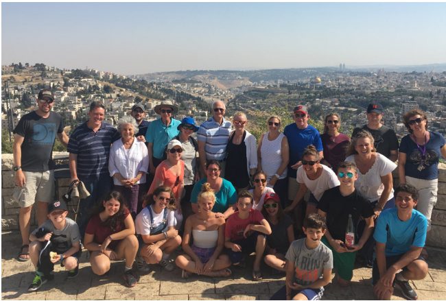
26 people went on the Summer 2017 Israel Trip

TSWRJ organized and hosted many programs throughout the year for its 450 members and many others, including a women’s retreat for learning, singing, praying, and enjoying time together; a dinner hosted for 50 guests of the Children’s Inn at the National Institutes of Health; a mah jongg event for 60 novices and mavens; a Fashions for All Generations fashion show that raised funds for TSWRJ activities; and the highly-anticipated annual Chanukah Mart (featuring more than 800 latkes).