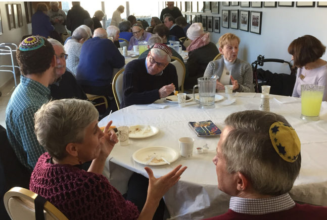
Members gathered at 23 lay-led Kehillat Shabbat services and kiddush lunches throughout the year.

Temple Sinai's clergy, working together with members of the congregation's Ritual Committee and Music Committee, maintained a full schedule of creative and inclusive Shabbat, holiday, and special services. We joined together to celebrate joyous passages and to mourn the loss of loved ones. Temple Sinai clergy provided compassionate pastoral support and care.