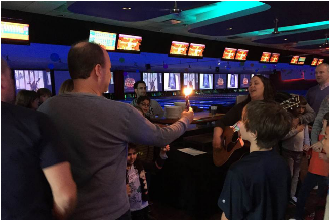
Celebrating Havdalah at a Mishpacha Bowling night.