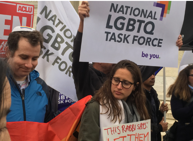
Our clergy and many members advocated for Jewish principles of social justice on many occasions throughout the year.