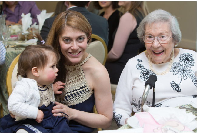
Temple Sinai's Ritual and Director staff hammed it up on Purim, Second Grade families gathered for havdalah, and members of all ages gathered for the Community Second Seder, hosted by TSWRJ.

84% of members requested High Holy Day tickets and over 8,600 tickets were collected across 16 services on Rosh Hashanah and Yom Kippur.