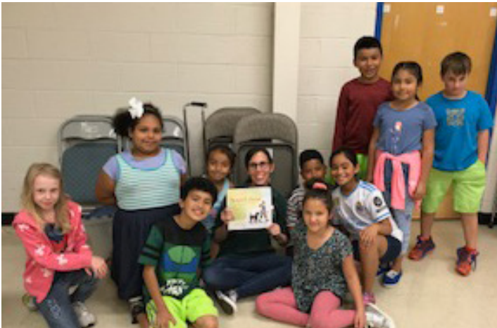
200+ members provided financial support to teachers and low-income immigrant parents and students at Highland Elementary School in Silver Spring, MD through Project Mensch. Some of those members provided ongoing direct program and educational support.