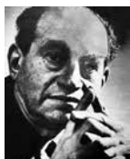
Boris Aronson (1899–1980) conceived the design for our bimah. He was an artist known for set design of Broadway shows including Cabaret , Company , and Fiddler on the Roof .

on the bimah were designed by George Nakashima (z”), known for creating innovative, elegant furniture that grows out of the beauty of its wood.