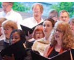
Members of the choir, in-house band, and other volunteers give their time to bring musical programs to the community.

page 19). Shabbat services are held on Friday evening and on Saturday morning.